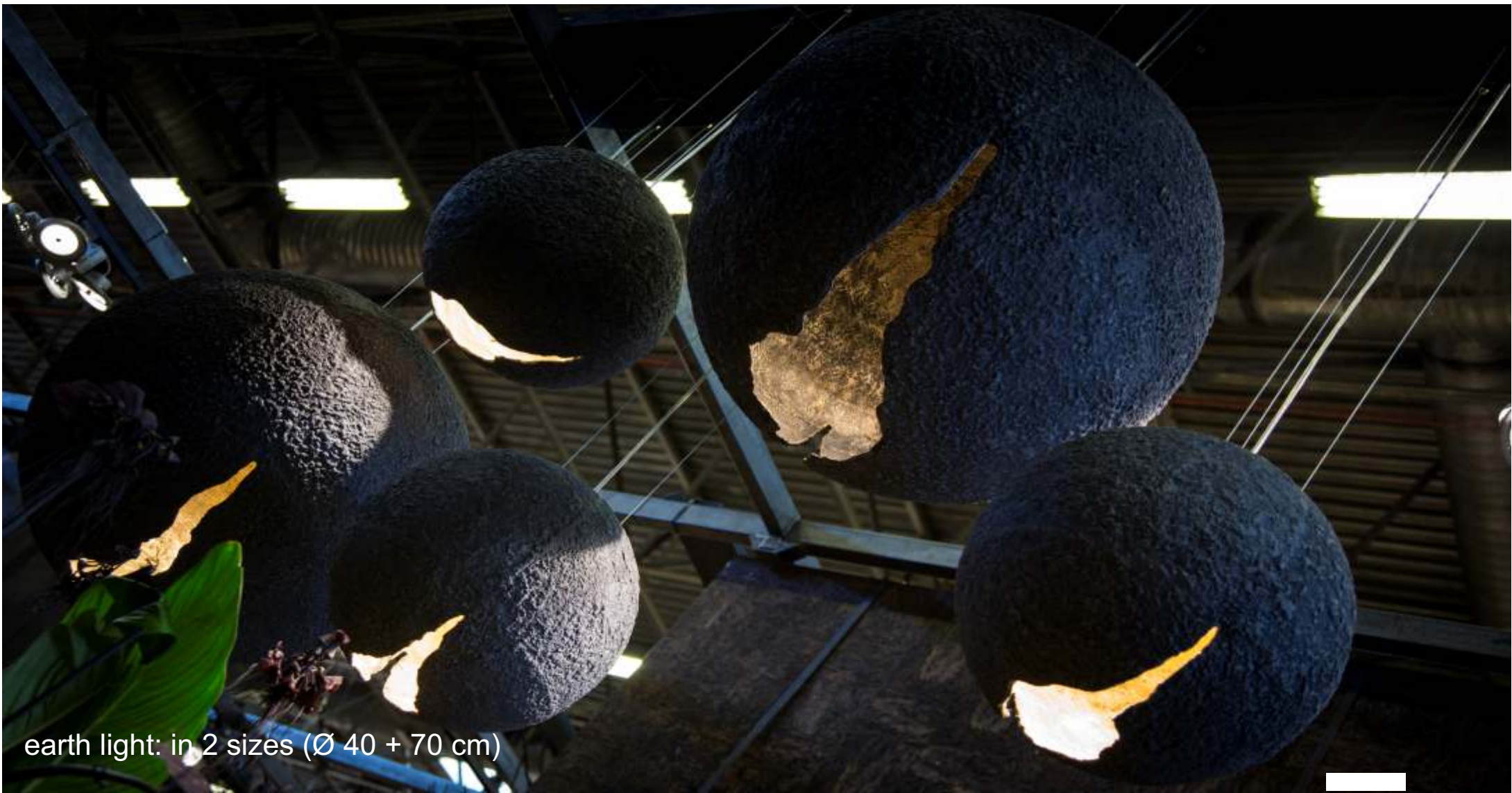
earth light: in 2 sizes (Ø 40 + 70 cm)

The earth light has a brown gold inside and an outside in stonish brown / black or matt Ral colour