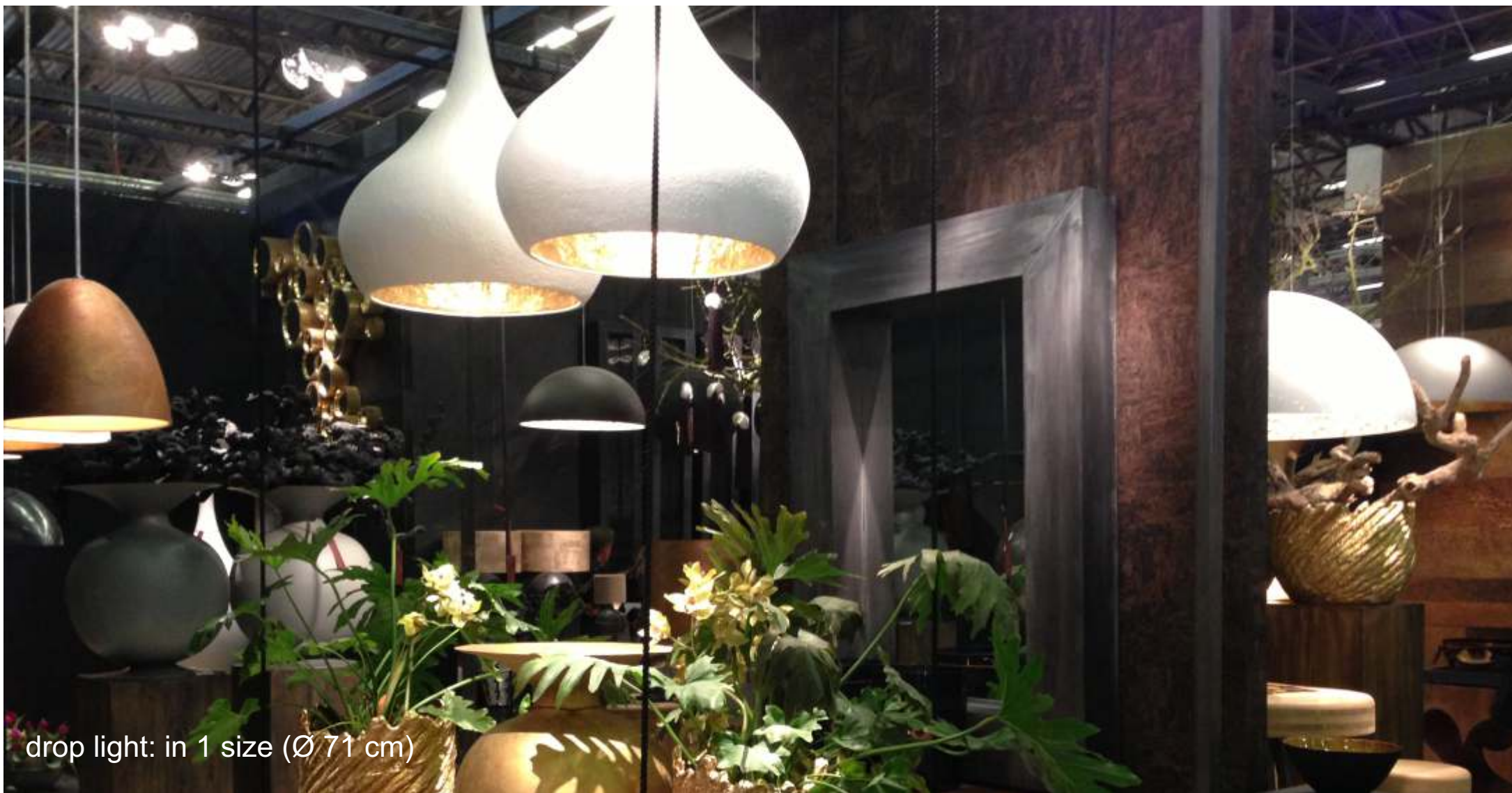
drop light: in 1 size (Ø 71 cm)

A light with a shiny gold inside. The outside can be made in every matt RAL, Histor and Sikkens colour.