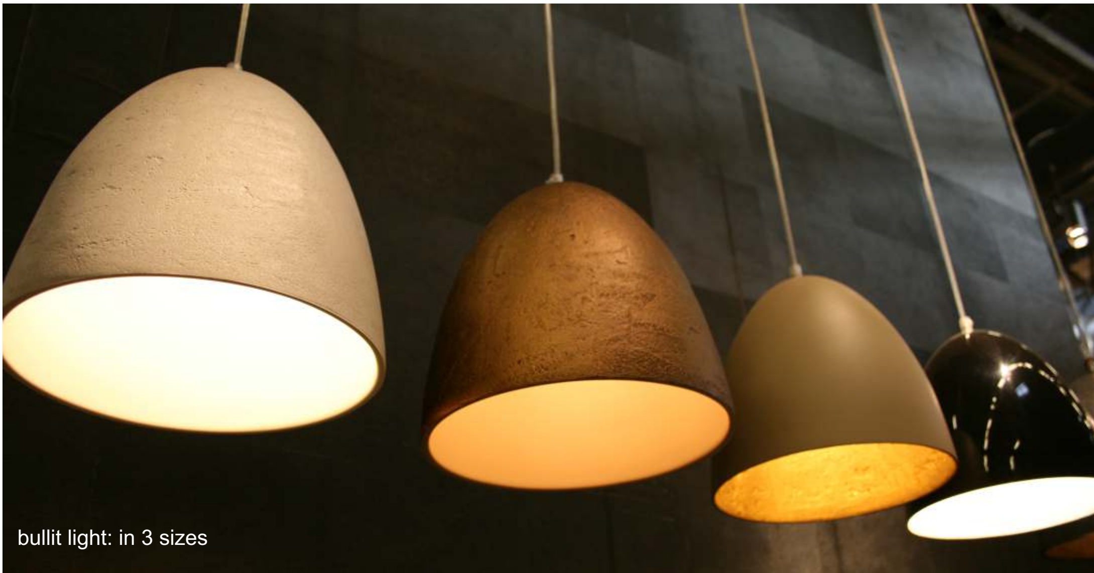
bullit light: in 3 sizes

A light available in 3 sizes (25, 35 & 63 cm diameter) where: