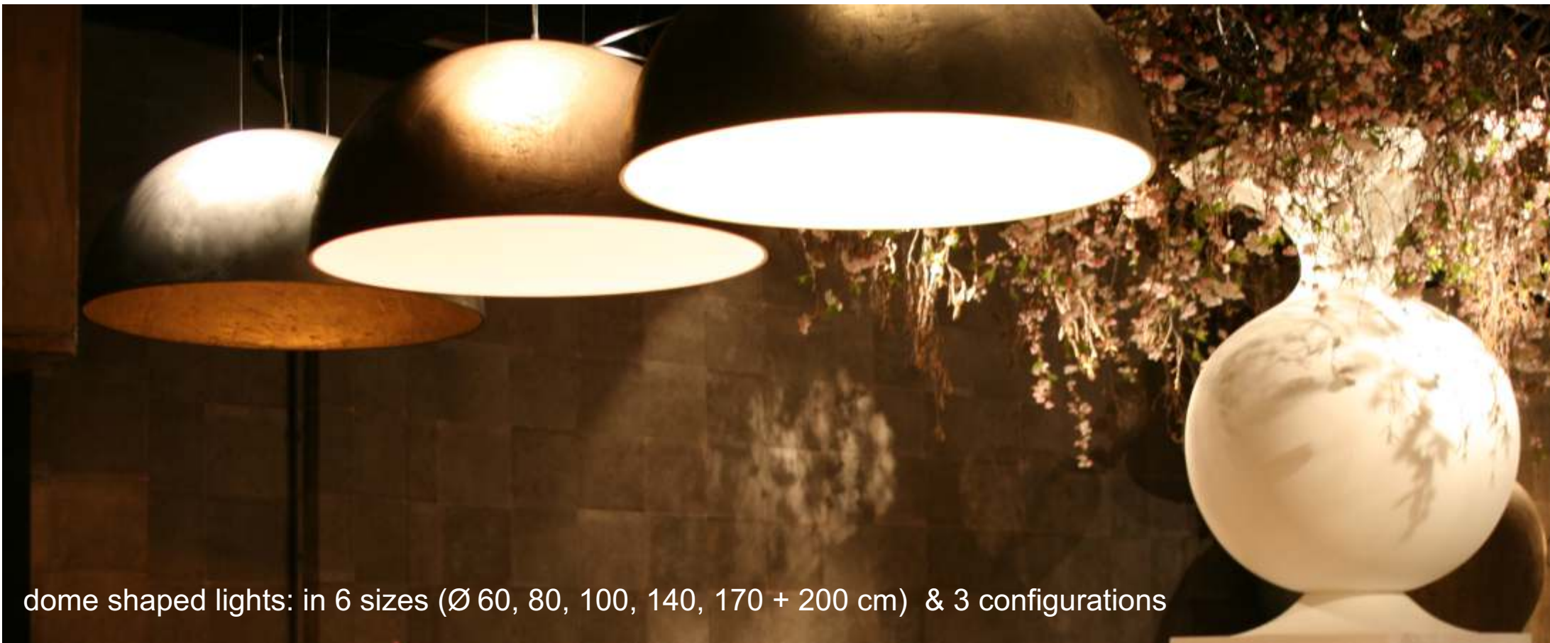
dome shaped lights: in 6 sizes (Ø 60, 80, 100, 140, 170 + 200 cm) & 3 configurations

A light available in 6 sizes which comes in 3 configurations: