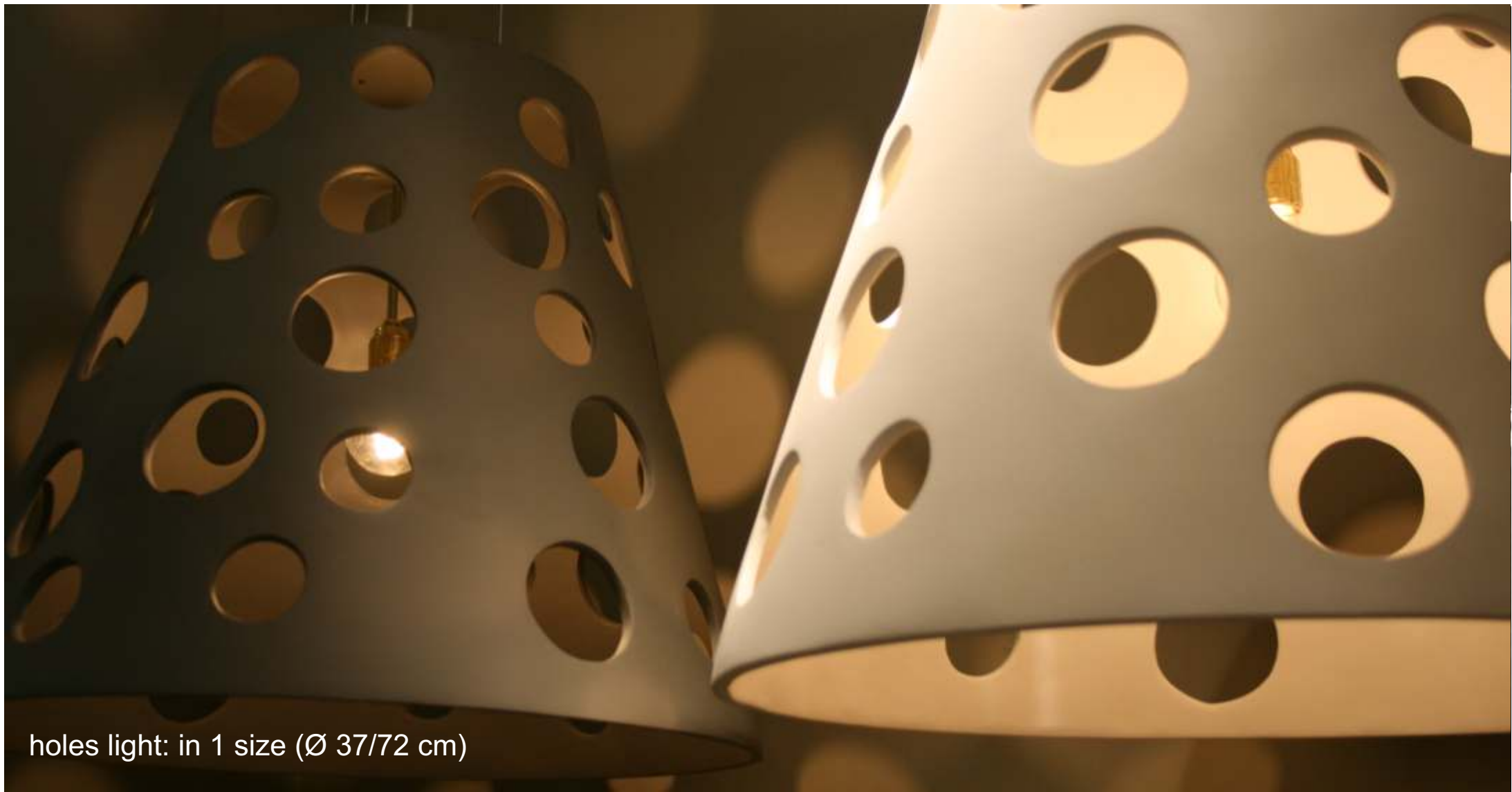
holes light: in 1 size (Ø 37/72 cm)

A light which CAN be made in every matt RAL, Histor and Sikkens colour.