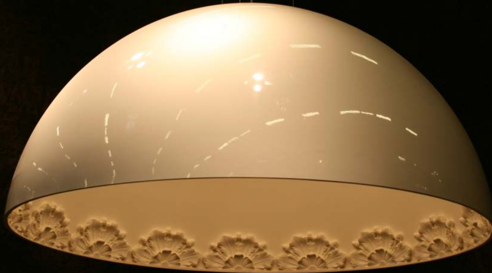
dome shaped light 'Barock': in 4 sizes (Ø 60, 80, 100 + 140 cm)

A light available in 4 sizes (60, 80, 100 & 140 cm diameter) where: