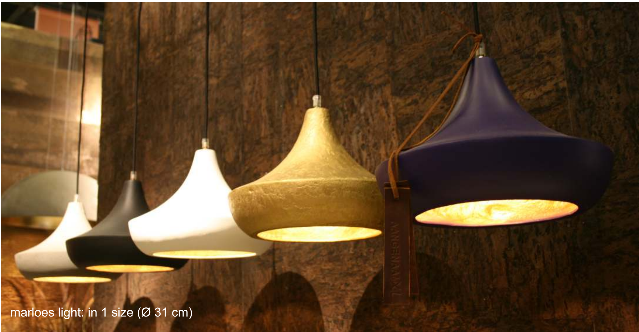
marloes light: in 1 size (Ø 31 cm)

A light with a shiny gold inside and an exterior which can be: