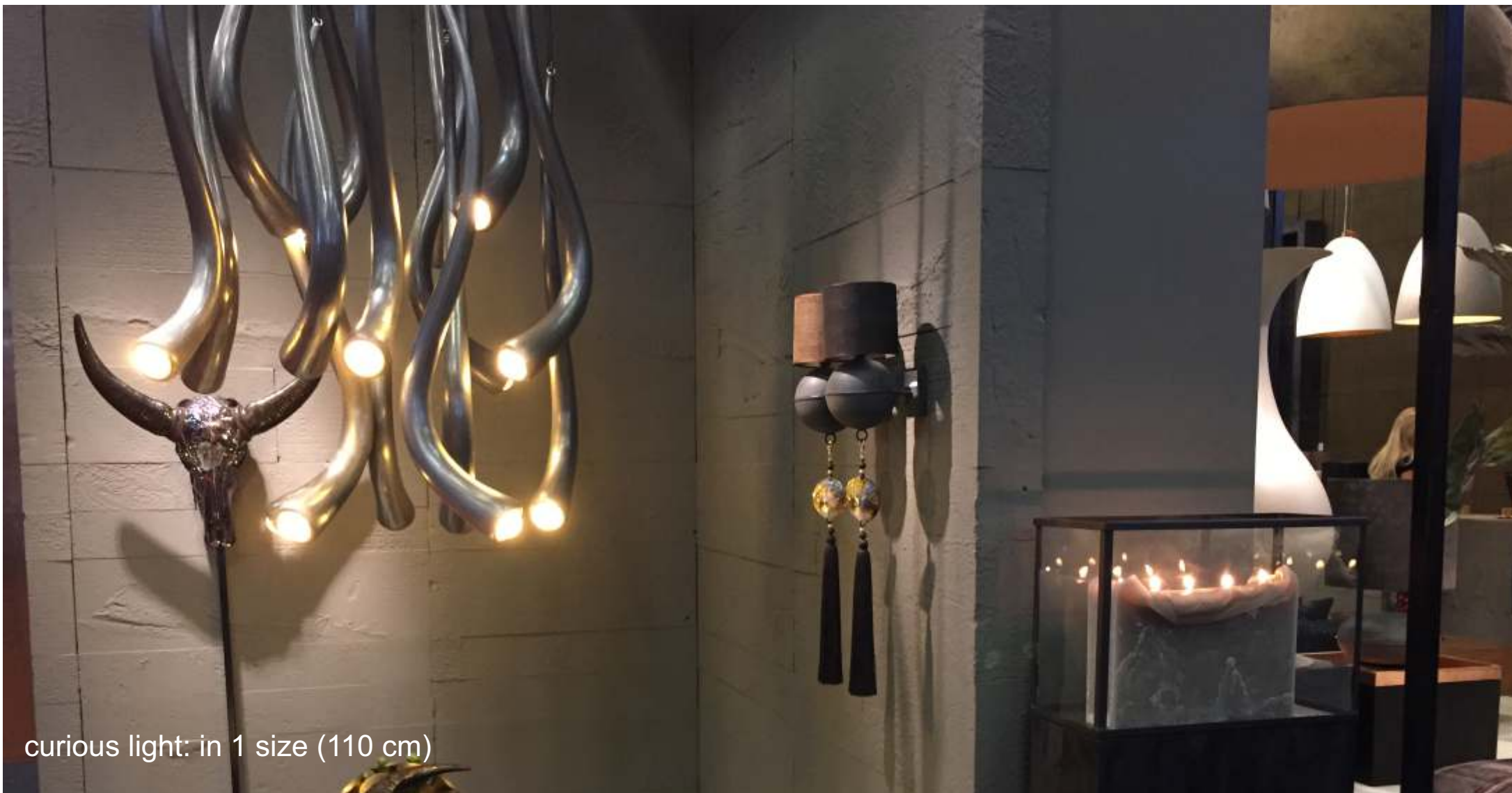
curious light: in 1 size (110 cm)