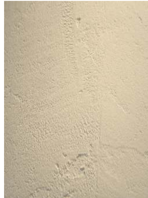
Rough finish (all colours)