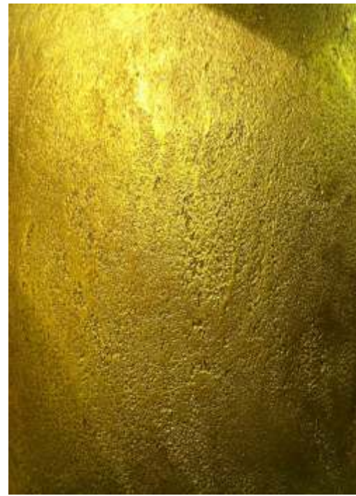
Gold rough finish